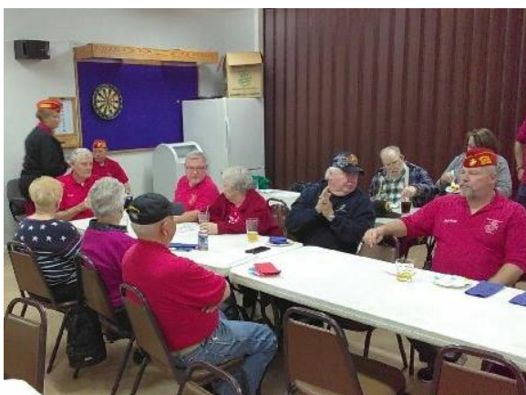
Everyone enjoying some United States Marine Corps 244 th Birthday Cake.