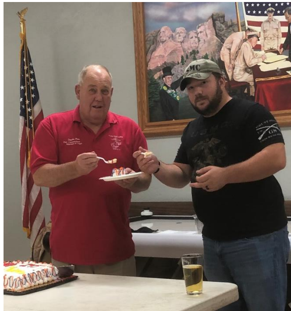
The oldest and the youngest enjoying the first piece of cake.